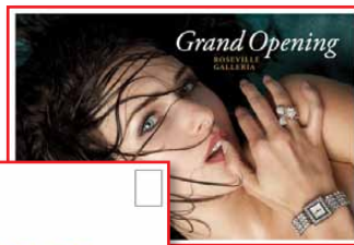
Variable Data at full speed